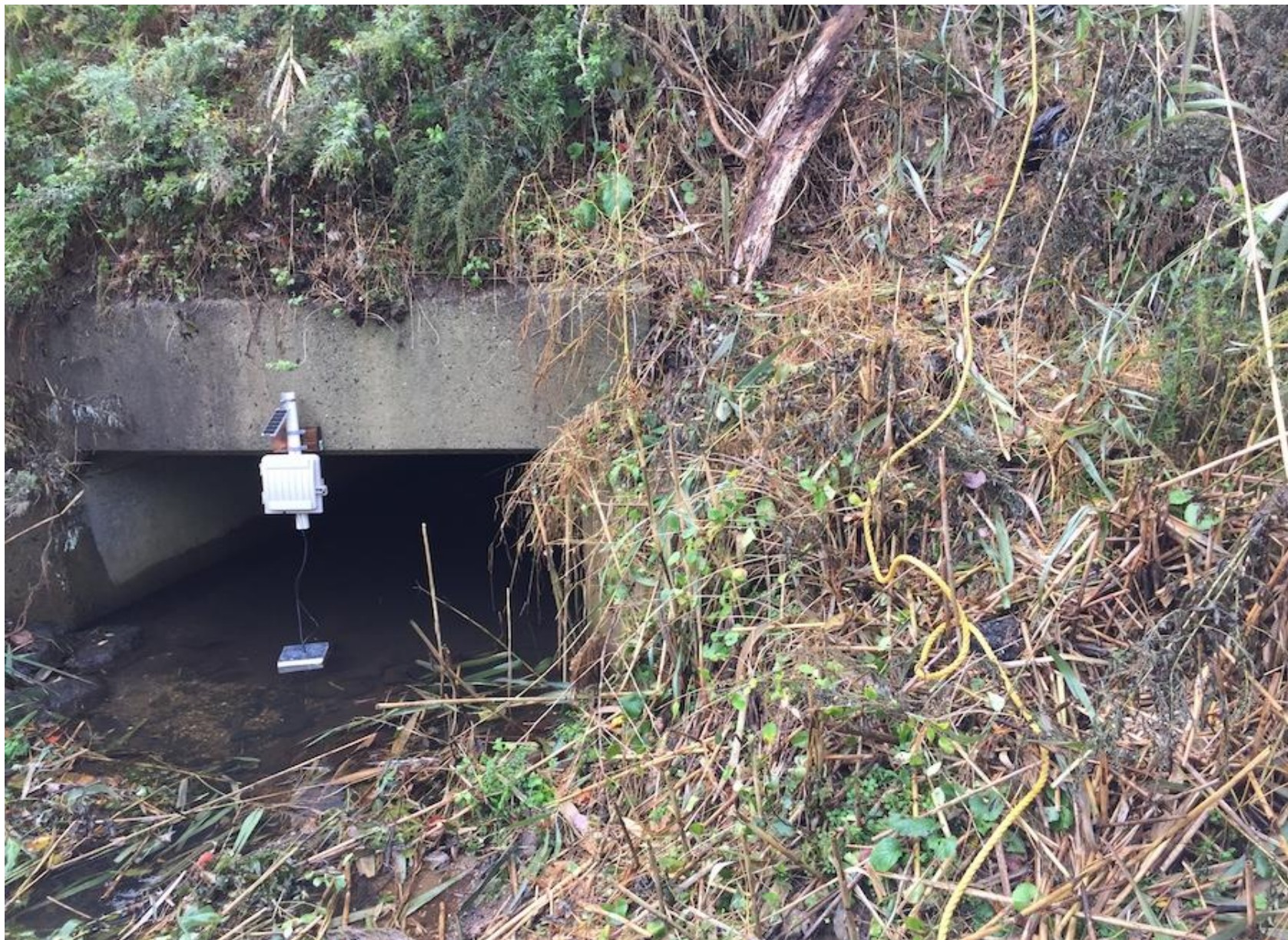
PTC1 located on a culvert that crosses under the Pa Turnpike