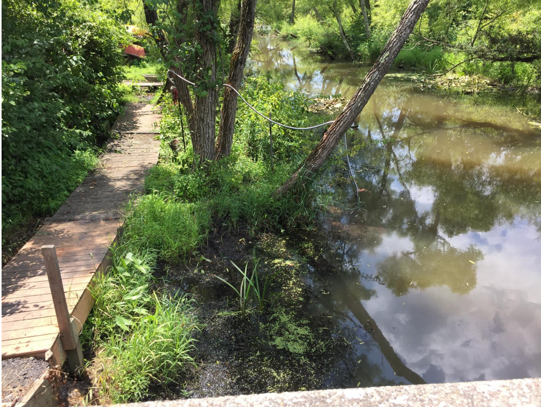
Beaver proofing SL149