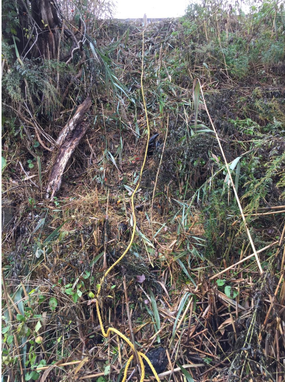
Access to PTC1