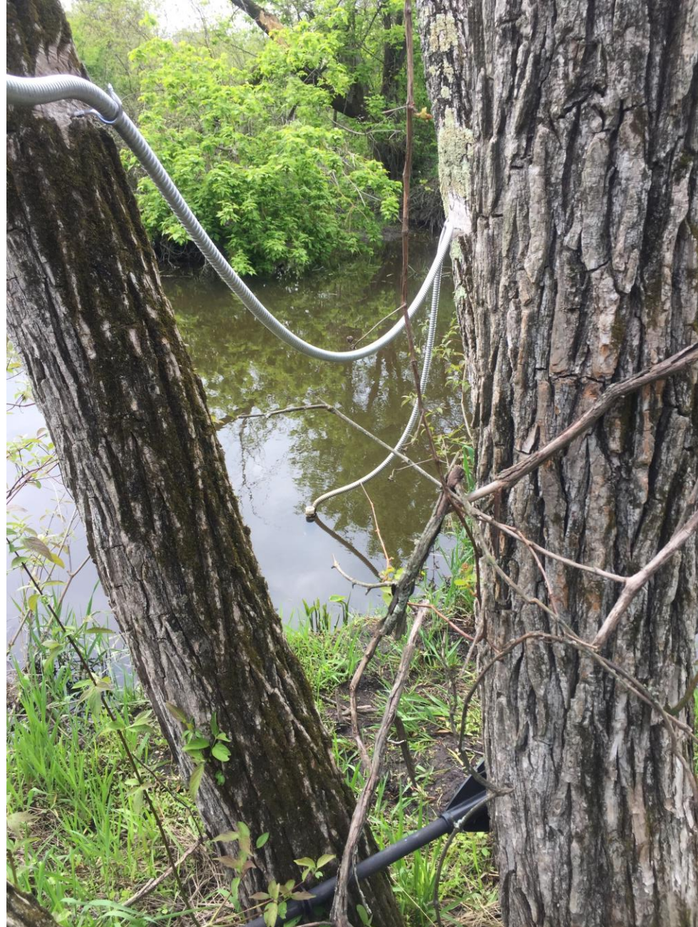
Beaver proofing (cont)